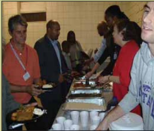
Dinner from Hog Heaven!