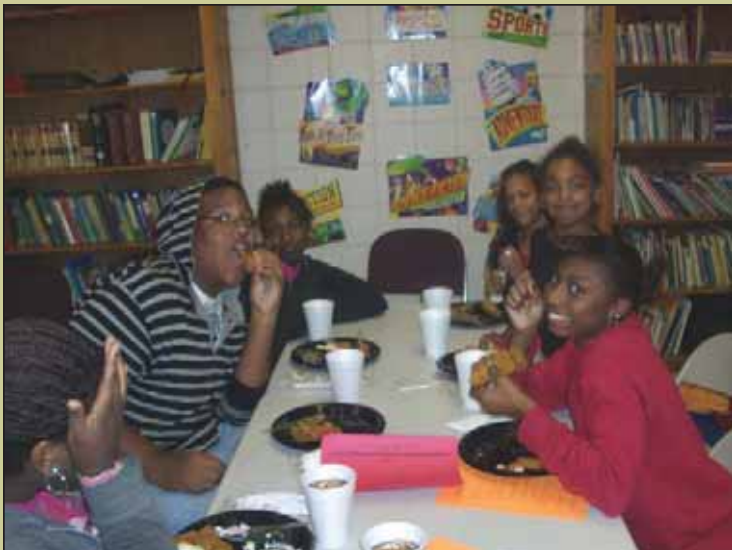
Parents Night at Chewing Middle School